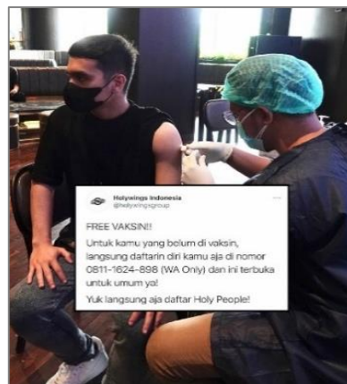
Figure 2: Free Vaccine Invitation

Figure 2 is a photo of a man being injected with the COVID-19 vaccine by a health worker at one of the Holywings Indonesia outlets during the "Vaccine at Holywings Check" activity accompanied by an invitation to free vaccines at Holywings on a different image layer by confirming registration to the WhatsApp number.