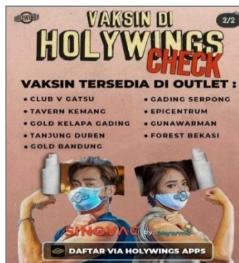
Figure 4: Outlet List of Vaccination Center

Figure 4 shows the COVID-19 vaccination centers available in several outlets such as Holywings Club V Gatsu, Tavarent Kemang, Gold Kelapa Gading, Tanjung Duren, Gading Serpong, Epicentrum, Gunawarman, Forest Bekasi, and Gold Bandung.