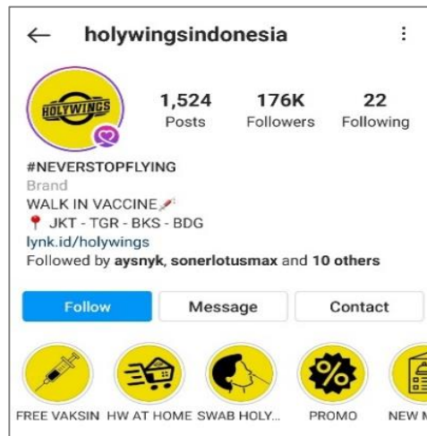
Figure 1: Instagram Account Description

Encoding is a prefix to understand the theory of encoding decoding (Tusnawati, 2017) which is to understand the meaning of @holywingsindonesia's Instagram content related to the conversion of nightclubs to COVID-19 vaccination centers. Figure 1 shows the name of an Instagram account using the hashtag #neverstopflying which means never stop getting drunk. The account category, which was previously Bar, has changed to Brand.