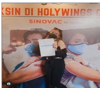
Figure 5: Vaccine Participant

Figure 5 shows a woman in a tank top with black carding and wearing sunglasses on her head who has participated in the “Vaccine at Holywings Check” activity.