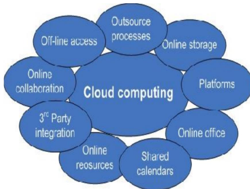
Figure 1. Cloud Computing Resources (Sun, 2020)

That cloud computing appeals to a wide range of individuals and organisations, from start-ups, telecommunications providers, educational schools, corporations, government agencies, and even begin. It provides consumers with many benefits and expense savings, allowing them to save vast sums of money that should have been spending on data storage facilities and infrastructure. The cloud-enabled operations depicted in Figure 1 are just a few sources of cloud technology's vast functionality in the education system, as well as other human endeavours. The benefits of cloud in education, according to Sun (2020), are as follows: